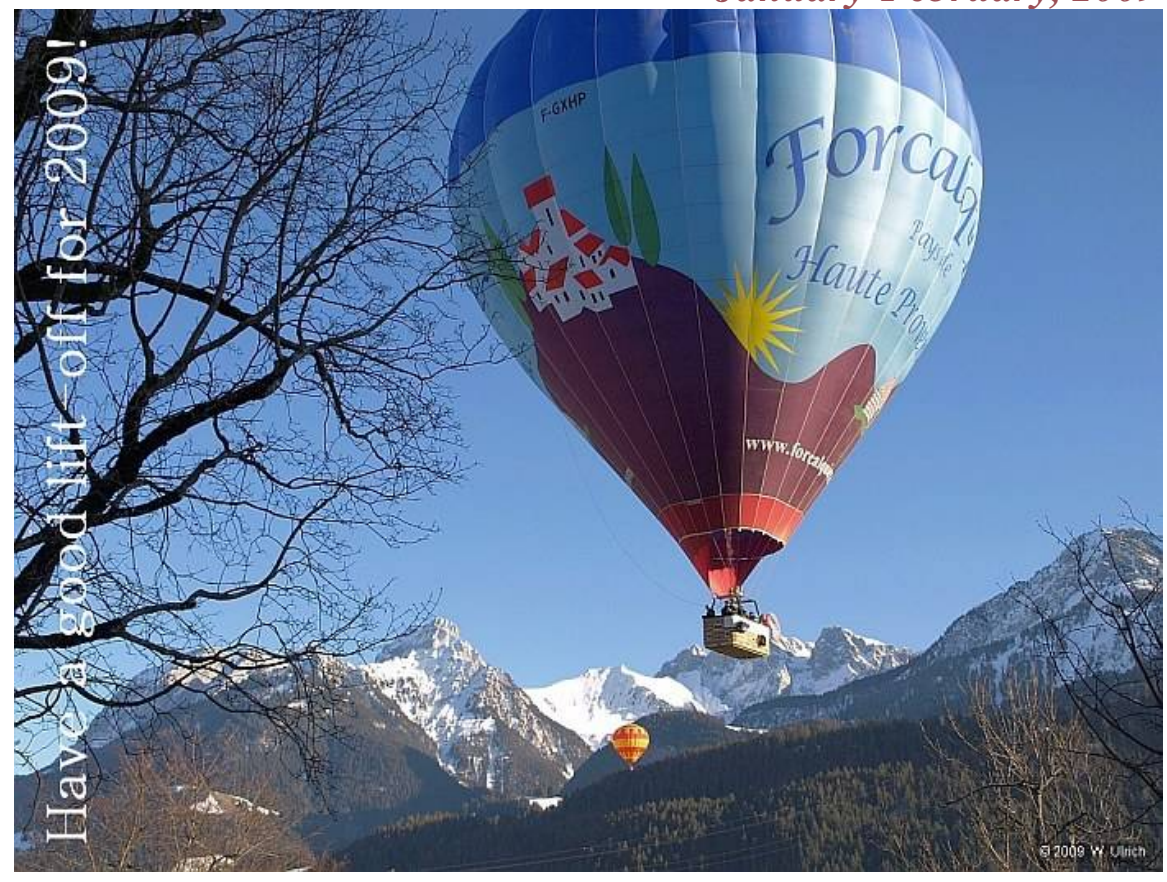
The Aristotelian value basis of practical reason: happiness, virtue, and prudence