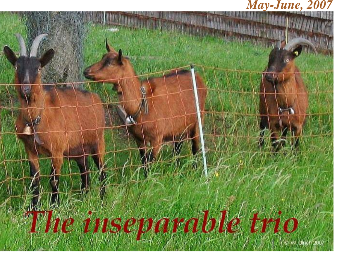
The inseparable trio (three cornerstones of critical pragmatism)

"We can situate critical pragmatism in the center of three research traditions: critical theory, pragmatic thought, and reflective practice. They constitute the inseparable trio of critical pragmatism ."