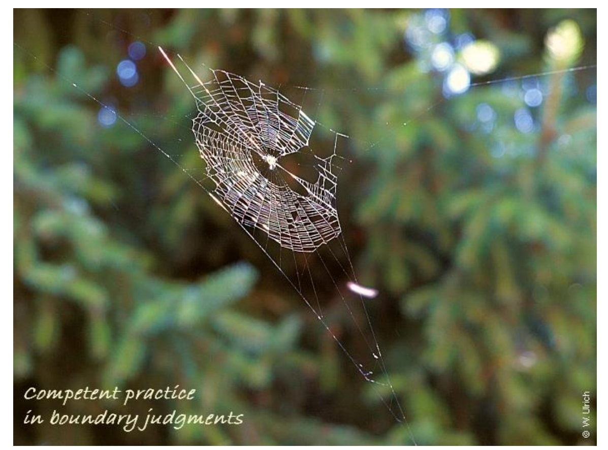
Competent practice involves a proper handling of boundary judgments