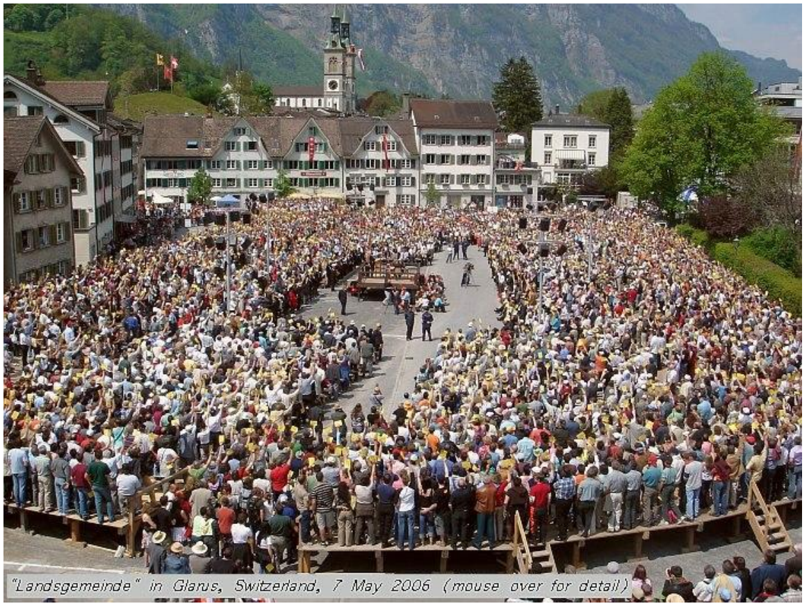
The public use of reason: Swiss "Landsgemeinde"

"Reason has no dictatorial authority; its verdict is always simply the agreement of free citizens, of whom each one must be permitted to express, without let or hindrance, his objections or even his veto."