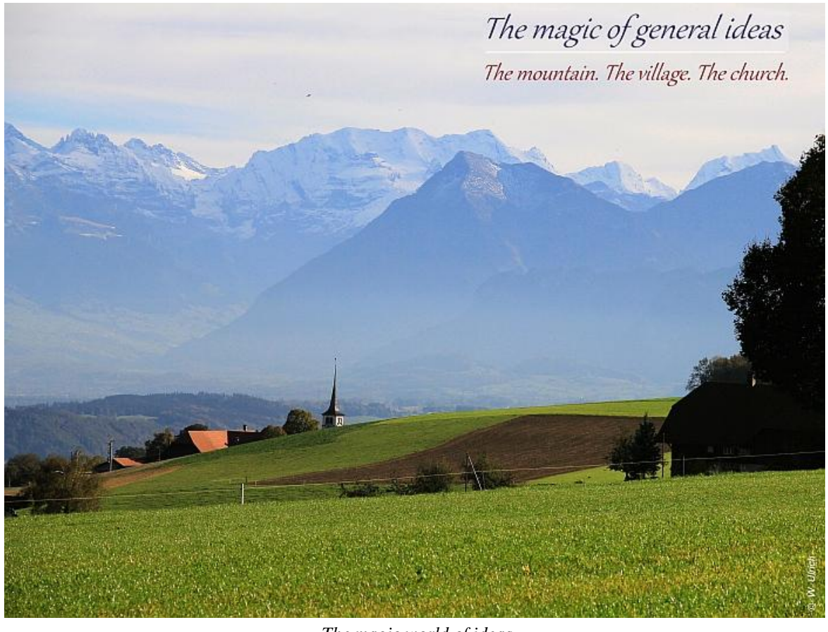
The magic world of ideas